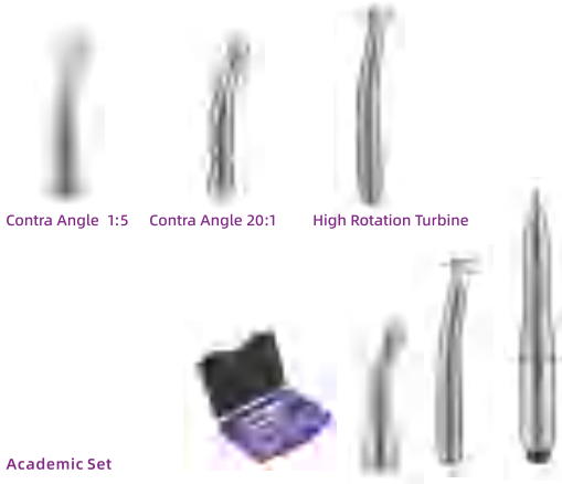
Contra Angle 1:5 Contra Angle 20:1 High Rotation Turbine